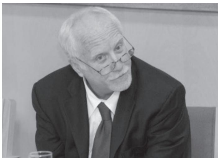
Richard Dreyfuss (film star and stage actor) gave a special lecture in College early this year. His "Reflections on the US Presidential election of 2004" was a highly personal evaluation of the presidential election.

As always, we are keen to welcome all Antonians whatever their interests. Further details are on the College Website: www.sant.ox.ac.uk , the University Website: www.africanstudies.ox.ac.uk and available from the Development Office at St Antony's - from whom you may obtain a booking form and draft programme. Email - dev.office@sant.ox.ac.uk , telephone 44 (0)1865 274496 or write Development Office, St Antony's College, Oxford OX2 6JF.