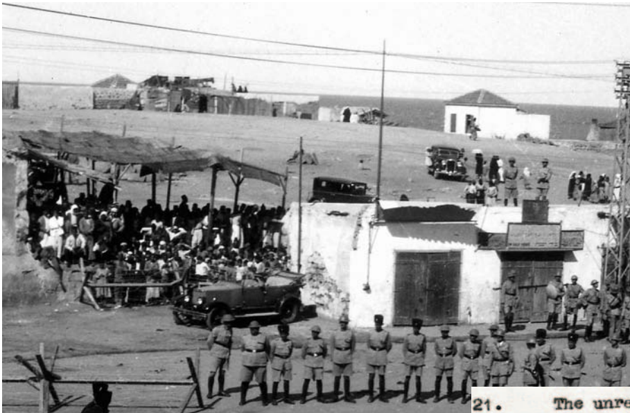
British and Arab members of the Palestine Police secure a road against riots in Jaffa, 1933

Although Palestinian Arabs tended to boycott the institutions of the Mandate, in protest against both