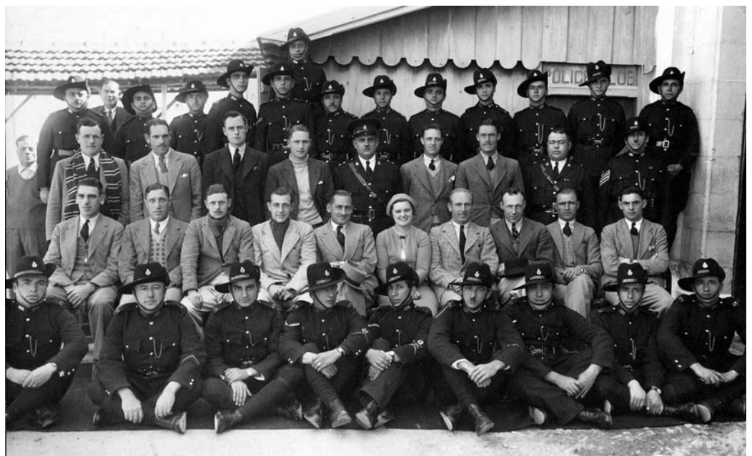
Jewish Supernumerary Police c. 1938