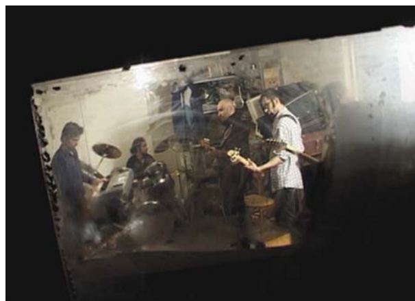
Off Beat, (documentary), 2003