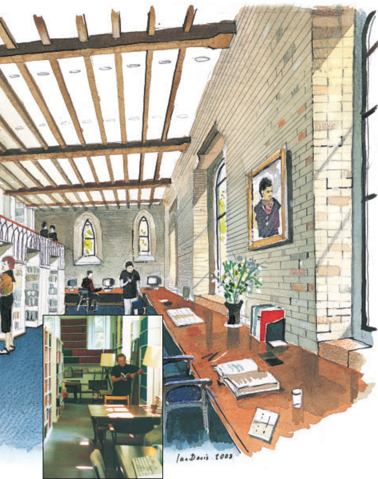
An artist's impression of what the redesigned Russian library will look like. Inset, the Russian Library as it is today.