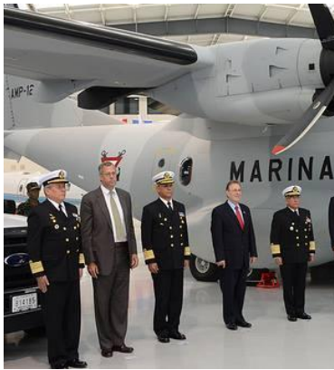
US delivery of Mérida Initiative aid, 2011.