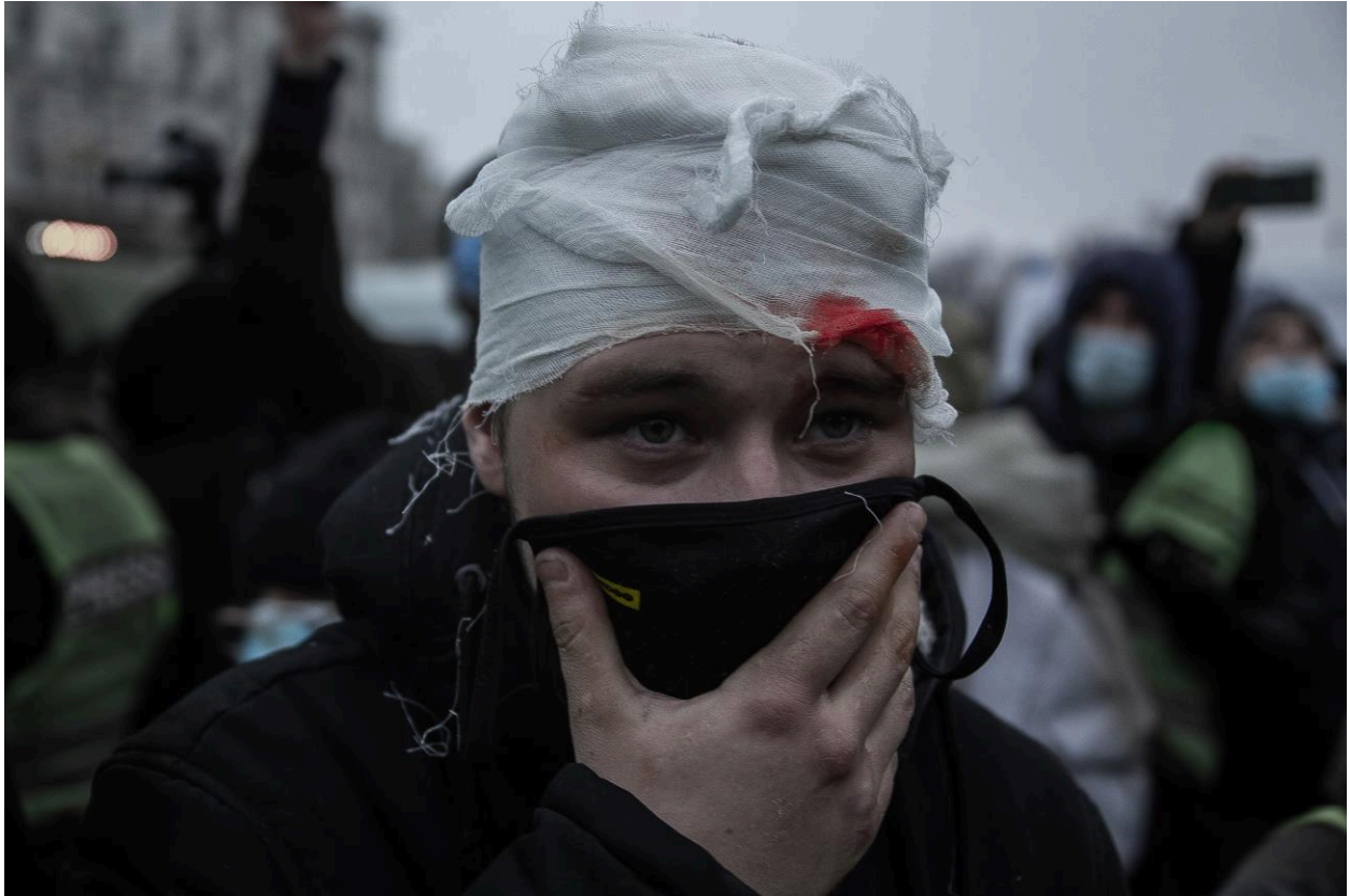
Protester hurt during Navalny protests in Moscow, January 23, 2021

live with people letting off steam on the streets for quite some time...as long as it doesn't become politically threatening." 20