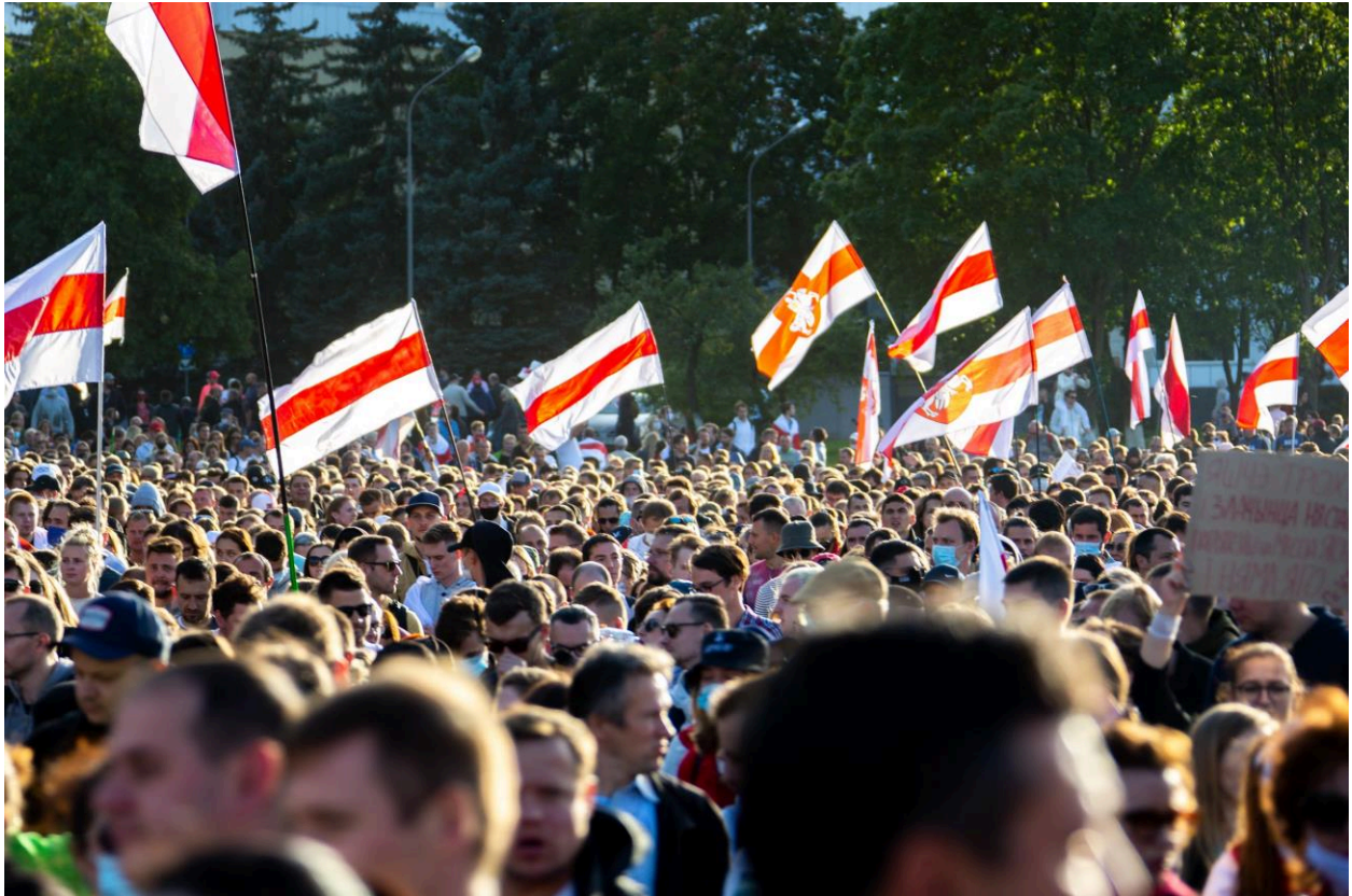
Minsk, September 13, 2020