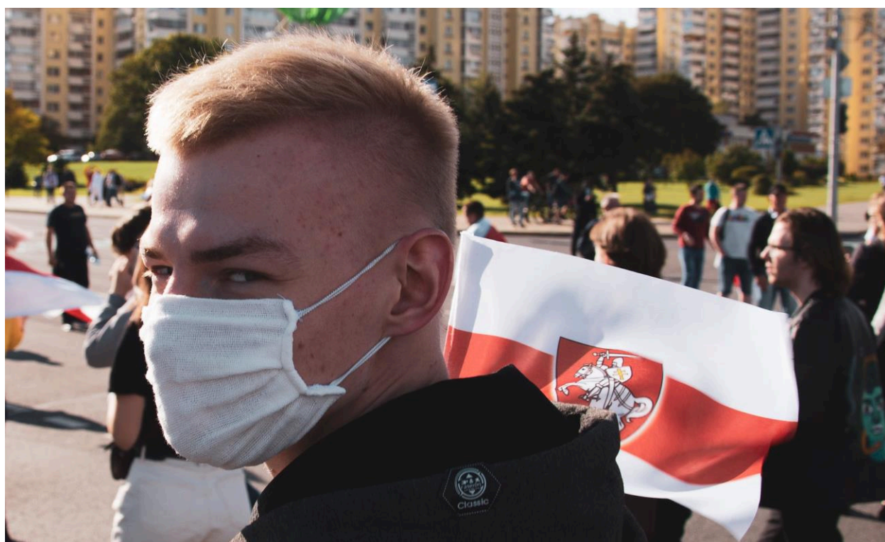
Protester in Minsk, September 12, 2020