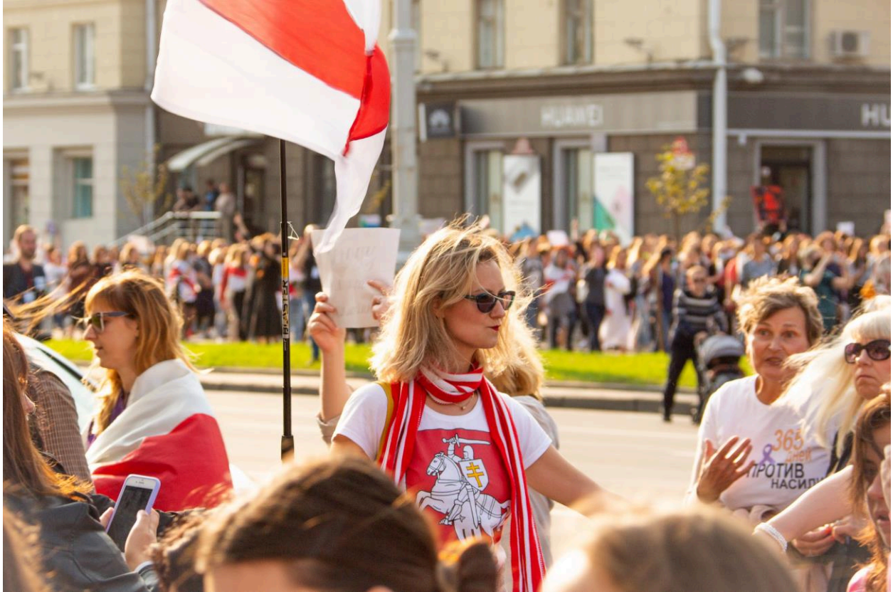
Women's March. Minsk, September 12, 2020