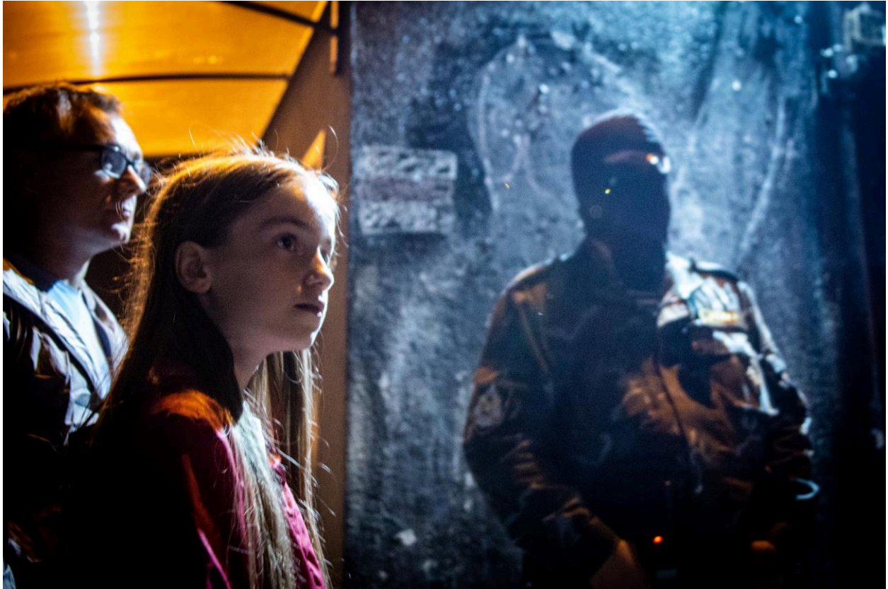
Masked Lukashenka's men invaded a nighttime neighbourhood vigil. . Minsk, September 12, 2020

these volunteer groups became a driving force behind the protests. The neighborhoods were really brought together by the protests.”