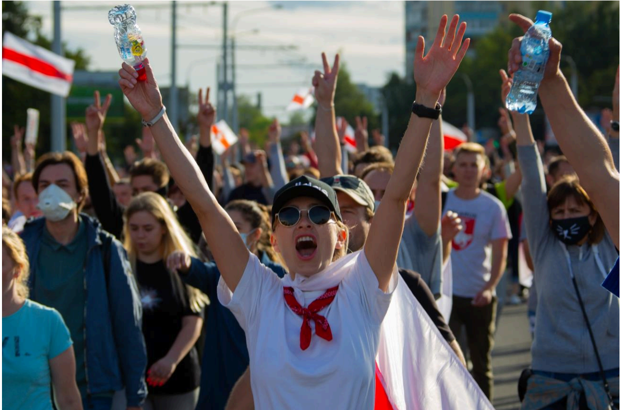
Protest in Minsk, September 12, 2020

revolution in Minsk. But this exodus means that the future of young Belarusians is in a European democracy. Even if they don't immediately attain that future in Belarus, they will do so elsewhere. Which means that the lesson of democracy that the 2020 protests provided was taken to heart.