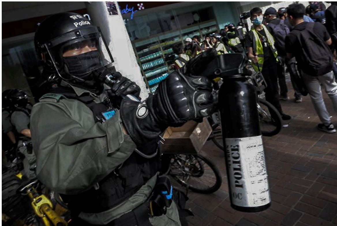
Hong Kong, January 2, 2020

One could see the importance of physical location in protests through the Maidan or the Tahrir square. In fact, the very word maidan in Ukrainian means “a square,” a sort of an agora. Physical camps, where protesters can come to recharge, organise and eat are extremely important —and authoritarians learned to destroy these spaces at all costs. In Hong Kong, activists turned to Bruce Lee’s wisdom —“be water,” they said. The fluid tactics of Hong Kongers, however, faltered under the CCP’s push.